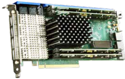
Features BittWare's XUPP3R with a custom expansion board

The host includes BittWare's XUPP3R FPGA board, up to a Xeon E5-2600 v4, 64GB (4x DIMMS), and dual redundant 800W power supply.